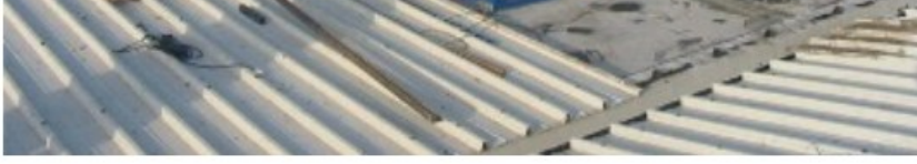
Trakya Cam San.A.Ş. Glass processing department Bulgaria Plant Fan rooms sound suppressor production and installation