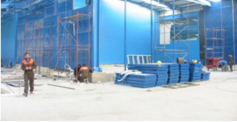
Tepekent Cold storage application