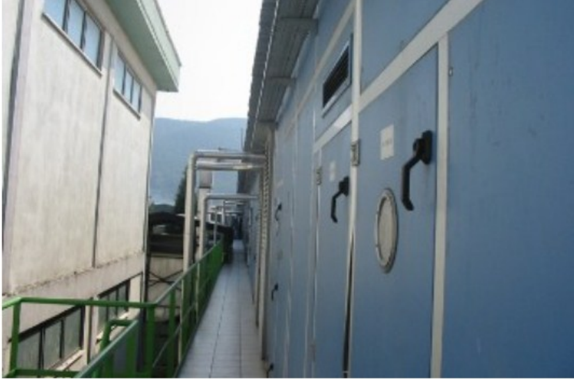
Aksa Akrilik Kimya San.A.Ş. Pilot yarn plant air conditioning system