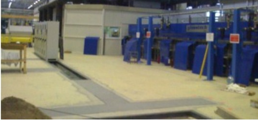
Akkim Kimya San. A.Ş. Yalova Plant Blower sound insulation application