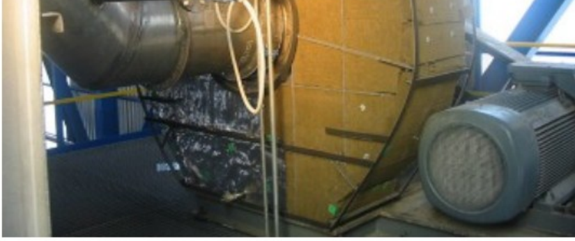
CHT TEKSTİL KİMYA SAN. TİC. A.Ş. Miscellaneous gas elimination systems