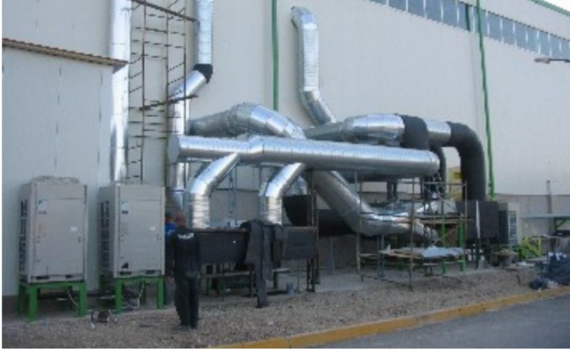
Trakya Cam San.A.Ş. Automotive Glass Plant CH 4 printing room air conditioning system